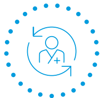
Professional and Experienced Staff

QPS is well known for its success in first-in-man (FIM) clinical trials. All QPS Phase I sites are staffed by expert clinical pharmacology teams that routinely conduct hundreds of Phase I/IIa trials annually. We also have scientific expertise in the design of all types of early phase clinical trials, including dose response, single ascending dose (SAD), multiple ascending dose (MAD), drug-drug interaction studies and more.