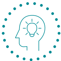
Medical Strategy & Insight

QPS Global Medical Affairs (GMA) cares about your unique clinical development program and the patients you serve. Our team is committed to providing deep scientific and medical expertise to enhance your custom-built research. We are comprised of a team of experienced scientific and medical experts who can provide strategic advice and clinical development support to ensure your clinical study success.