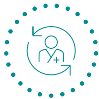
Professional and Experienced Staff

With its site management & monitoring teams operating from 30 locations on three continents (Asia/Pacific, North America and Europe), QPS has become a new strong player in the space of late phase clinical research services.