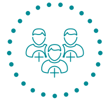
Preferred Provider Relationships