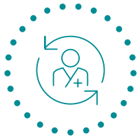
Professional and Experienced Staff

QPS is well known for its success in first-in-man (FIM) clinical trials. All QPS Phase I sites are staffed by expert clinical pharmacology teams that routinely conduct hundreds of Phase I/IIa trials annually. We also have scientific expertise in the design of all types of early phase clinical trials, including dose response, single ascending dose (SAD), multiple ascending dose (MAD), drug-drug interaction studies and more.