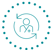
Professional and Experienced Staff

QPS is well known for its success in first-in-man (FIM) clinical trials. All QPS Phase I sites are staffed by expert clinical pharmacology teams that routinely conduct hundreds of Phase I/IIa trials annually. We also have scientific expertise in the design of all types of early phase clinical trials, including dose response, single ascending dose (SAD), multiple ascending dose (MAD), drug-drug interaction studies and more.