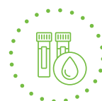
Central Lab Services

Since 1995, QPS has provided discovery, preclinical, and clinical drug development services. An award winning leader focused on bioanalytics and clinical trials, QPS is known for proven quality standards, technical expertise, a flexible approach to research, client satisfaction and turnkey laboratories and facilities. For more information on QPS, visit www.qps.com , or email infobd@qps.com .