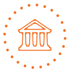
Regulatory & Medical