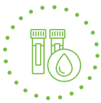
Central Lab Services