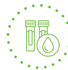
Central Lab Services

Since 1995, QPS has provided discovery, preclinical, and clinical drug development services. An award winning leader focused on bioanalytics and clinical trials, QPS is known for proven quality standards, technical expertise, a flexible approach to research, client satisfaction and turnkey laboratories and facilities. For more information on QPS, visit www.qps.com , or email infobd@qps.com .