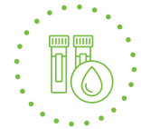
Central Lab Services