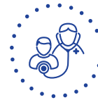
Clinical Research Units