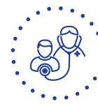
Phase I Clinics