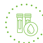
Central Lab Services

Discover how QPS can accelerate your clinical research.